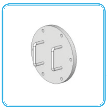
Name Series Application